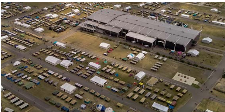
Jamboree NZ22 2019/20